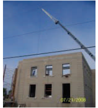
Adding the roof.

We have been fortunate to have a very giving and generous community. The board of trustees and I have been very pleased with the response by the many different businesses and service clubs that have stepped forward and offered financial support for the completion of this renovation and expansion project. Currently our board has raised approximately 95% of the funds needed to complete the entire project, and is working on the final touches of the capital campaign to raise the remaining monies. If you would like to contribute to this project or if you have any questions, please contact me at the library (419) 562-7327 ext. 114 or stop in to see me. Together we can all help to build a library that will be a part of the community for the next 100 years.