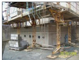
Ground view of the walls.